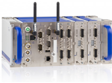
Fig. 1: imc CRONOSflex

The imc CRONOSflex modular measurement system provides the user an unprecedented degree of flexibility for configurations. The system does not require any racks or frames. Both the base unit and the modular measurement modules (amplifiers or conditioners) have independent housings: These can either be easily connected to a system by means of a robust “click” mechanism or alternatively used spatially distributed via a standard network cable. You can synchronously acquire various sensors and signals, analog and digital data, field buses, audio or video data.