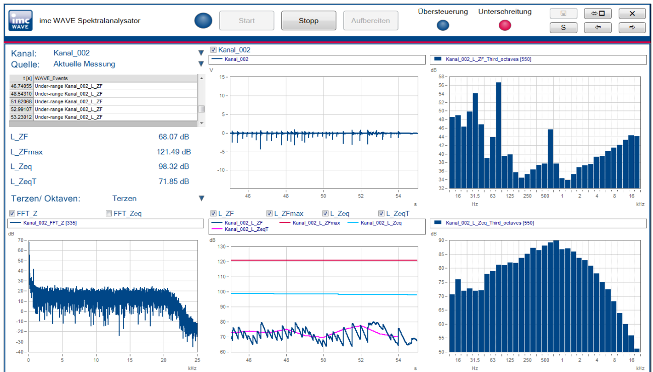
Fig. 2: imc Wave Spectrum Analyzer